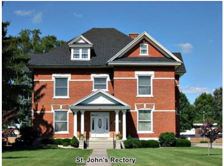
St. John's Rectory