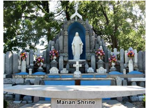
Pioneer Cemetery & Marian Shrine